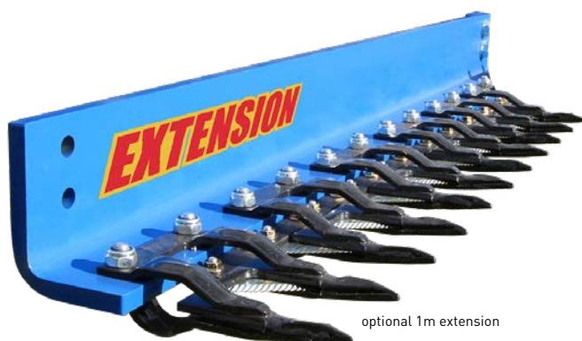
optional 1m extension